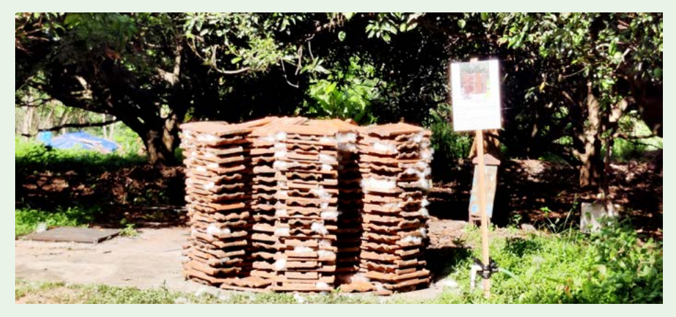
Remembering one of the world's biggest industrial catastrophe--Bhopal gas tragedy.